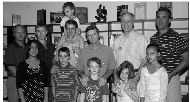
Pictured: Third place essay winners