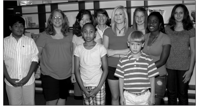
Pictured: First place essay winners

The 2008 Father of the Year Essay Contest was sponsored by First Things First, The National Center for Fathering, The Chattanooga Lookouts, and the Riverbend Festival.