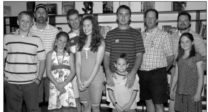
Pictured: Second place essay winners